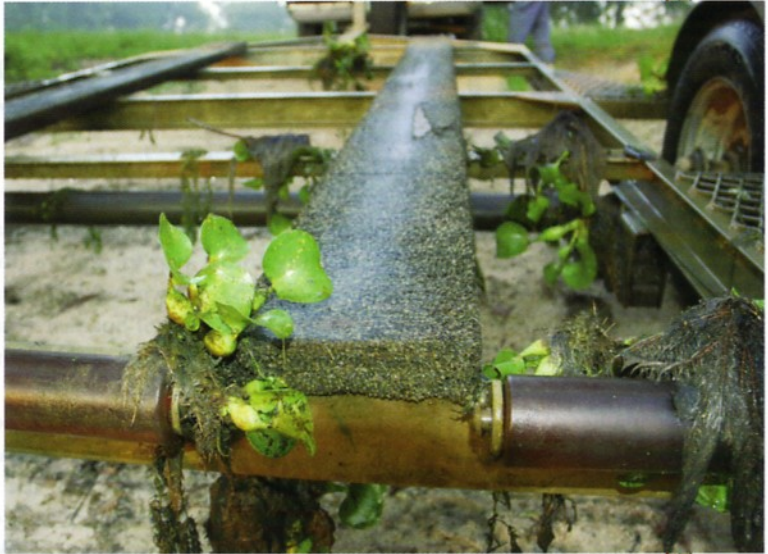
After a day on the water, check your boat, trailer and gear thoroughly for plant remnants. Dispose of them properly.

Says Hubbard, "I think if people step back and look at the whole picture, realize how detrimental water hyacinth is to our lakes and rivers, they'll do all they can to help keep it from spreading." ★