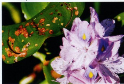
TOP © KENDAL LARSON; BOTTOM © LARRY DITTO

"The real problem," Marks explains, "is they wreak havoc with the native